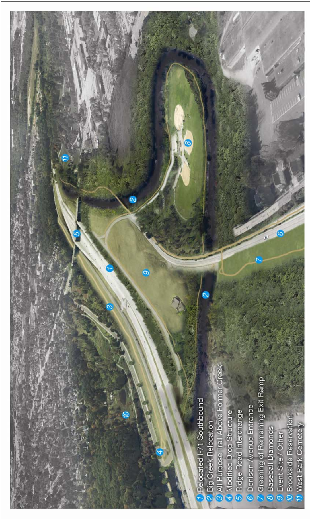
Figure 21: Southwest Aerial rendering – Proposed